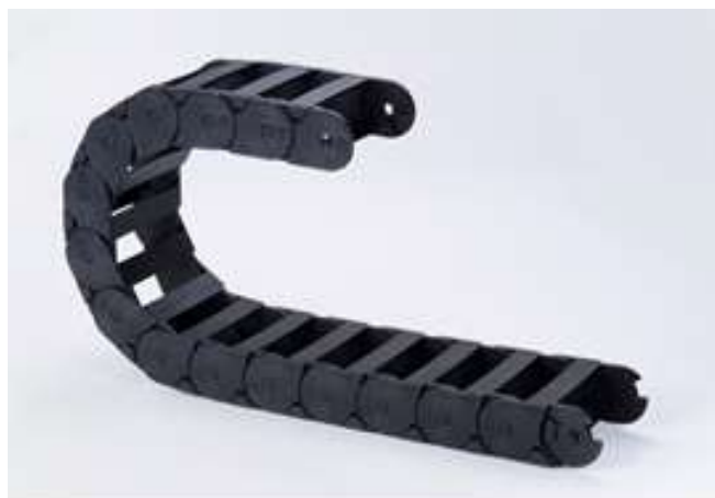
General type cable drag chain