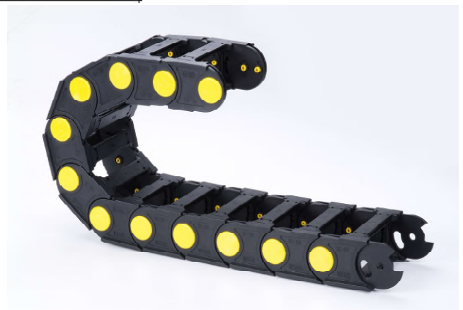
Enhanced type cable drag chain