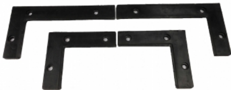
Machine way wipers (mold mass production)