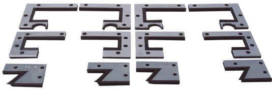
Customized machine way wipers